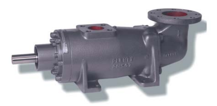
Ductile Iron 6300 with Flanged Ported Case